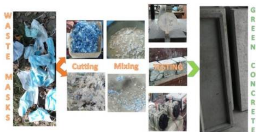
Figure 1: Methodology to Use Waste Masks in Concrete

Surfaces have 100 times less of a probability of transmitting COVID-19 than a direct contact with an infected individual. According to other research, coronavirus may survive on plastic for up to three days and on cardboard for one day. The usage of facemasks in concrete is not problematic since there is less chance of COVID-19 spreading through facemasks due to the virus's short lifespan on plastics. But steam treatment, as advised by WHO, is another option for cleaning the masks. Given that concrete has a pH of 13, the virus's ability to survive there may also be problematic. For seven days, the masks were gathered and left. They were cleaned with an alcohol-based disinfectant spray for added protection. The use of waste PPE as an efficient composite material for building is now being researched. The study's approach is displayed in Figure 1. The used masks are processed into fibered and square-shaped crushed forms. The masks were fibered in a machine that harvests cotton fibres since fibres are needed in concrete to increase certain qualities. At 0.5, 1.0, 1.5, and 2.0% of the concrete volume, the mask fibres were added. The fibres were not consistent in size or shape since they were taken out of a cotton fibre extraction machine; instead, they looked like a jumbled, messy cluster (see Figure 1)